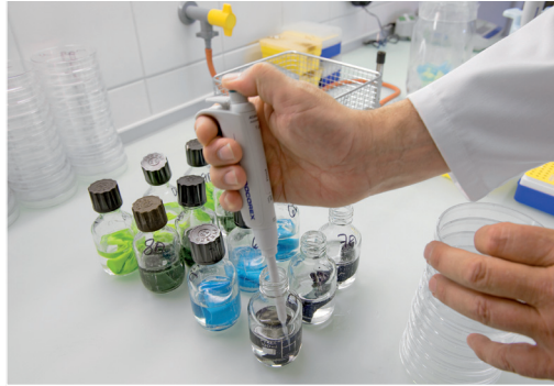
Fig. 3: The set of dilution is stroked out with the micro pipette for determining the exact germ count.

On an untreated sample there are about a million germs after a 24-hour incubation period. On a treated sample, we ideally only find a fraction of the germs that were put there. In the case of the Leica DM500 und DM750 with the AgTreat™ coating, we found that germs had been reduced by between 90 and 99.9 per cent.