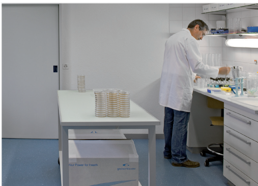
Fig. 2: SANITIZED carries out around 20'000 microbiological tests every year in accordance with standardized methods.

The AgTreat™ coating protects users from a large number of bacteria types. We examine the particularly relevant germs in our laboratory. Some of them are hospital germs like the methicillin-resistant Staphylococcus aureus (MRSA), which is resistant to certain antibiotics and is a particular risk for antibiotic patients whose own immune system is incapacitated. A temperature of about 37°C is ideal for MRSA to multiply and eventually paralyze the complete organism. However, we're also talking about food-relevant germs such as Escherichia coli bacteria which mainly populate the intestinal tract but can lead to dangerous infections elsewhere. Food can also often contain salmonella, which cause serious diarrhoeal diseases.