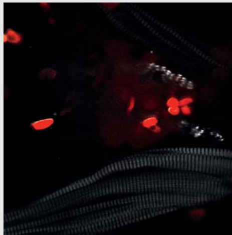
Blood cells labeled with DsRed (red) in zebrafish embryo, second harmonic generation (SHG) signal of muscle (gray).