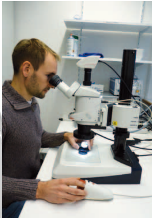
Figs. 4 – 5: Alcon Grieshaber attaches great importance to individual ergonomic features of the microscope and the workplace.